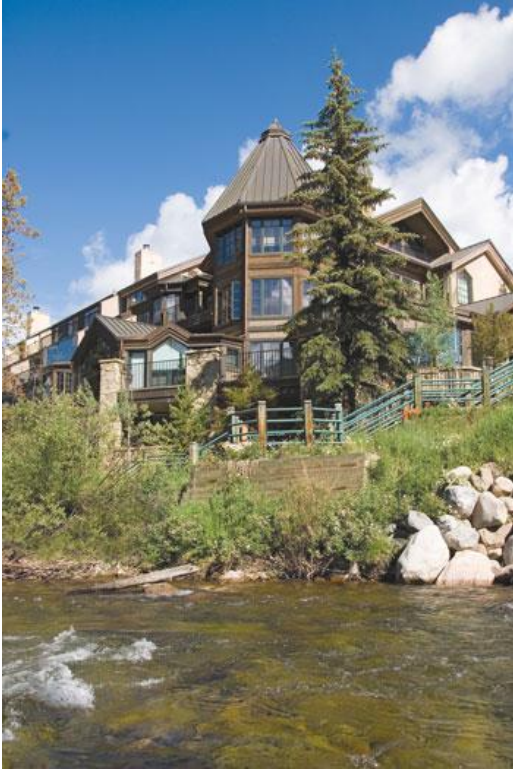
Vail Golf Course lodge